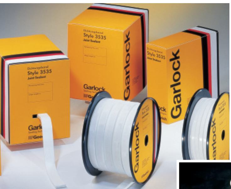
Style 3535 Joint Sealant