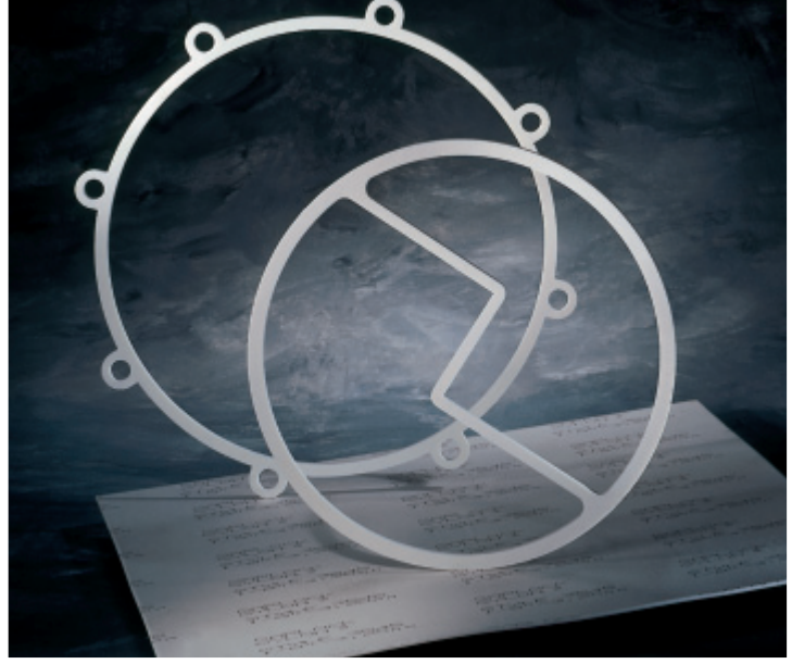
GYLON Style 3545